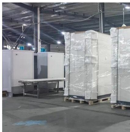
ABB central inverters PVS800 - 500 to 1000

Sungrow central inverters come in a standard 10 or 20-foot container size, start at 500 kW and are available with up to 6.8 MW power output. Discover SunGrow central solar inverters at ...