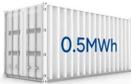
Standard 20ft containers